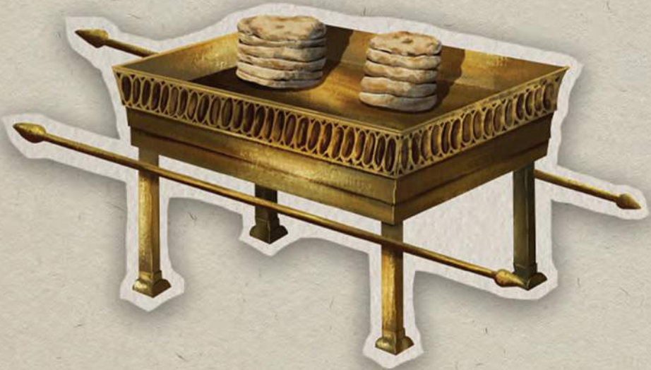
Table of Showbread

The Showbread is the symbol of the Word of God.